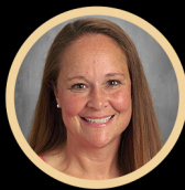
Sylvia Davis Mashburn ES